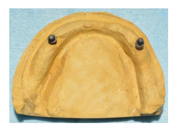
Figure 13 : Completed master cast with implant analouges