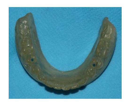
Figure 6: Surgical guide