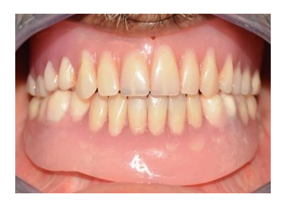
Figure 15: Post insertion intraoral view

A 9 months follow-up revealed a great degree of improvement in retention and stability. An overall improvement in the quality of life was noticed in the follow-up appointments. The general health of the patient was improved because of better nutritional intake.