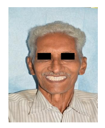
Figure 16: Post insertion extra oral view