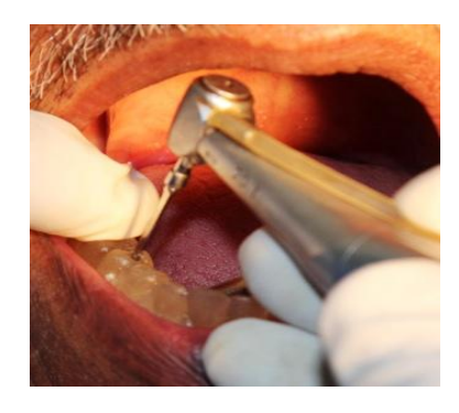
Figure 9: Initial access for osteotomy using surgical guide