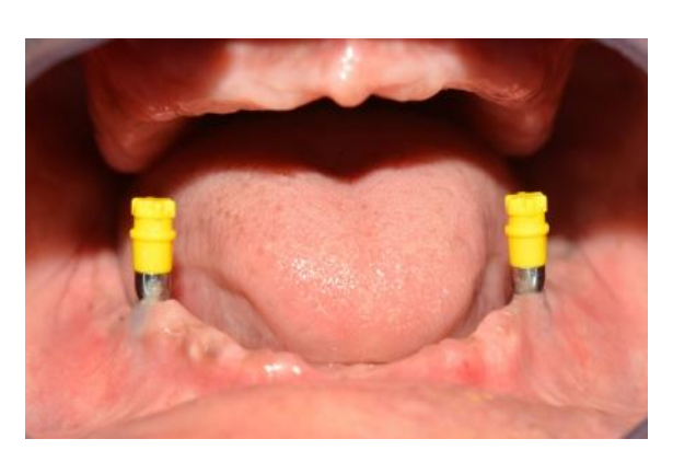
Figure 12: Transfer caps snapped on ball abutments