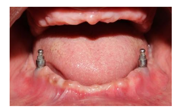
Figure 11 : Single piece implants and ball abutments in situ