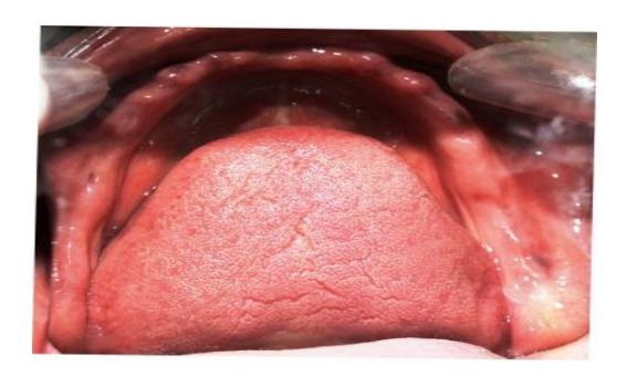
Figure 4: Preoperative occlusal view of mandibular arch