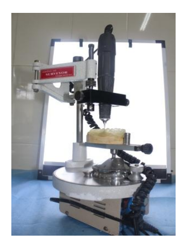
Figure 7: Determination of osteotomy site and angulation