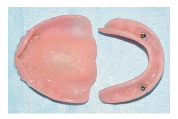
Figure 14: Intaglio surface of maxillary complete denture and mandibular overdenture